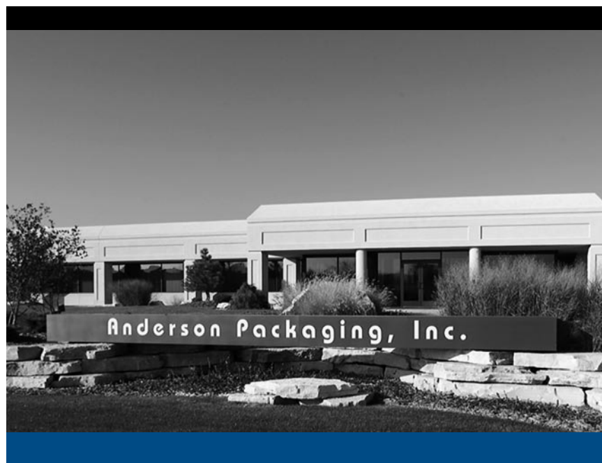
Anderson Packaging is expanding its operations at the Rockford Global Trade Park.

The $15 million, 260,000-square foot addition at its Rockford Global Trade Park campus near the Chicago/Rockford International Airport will put Anderson Packaging's total square footage at 1.2 million.