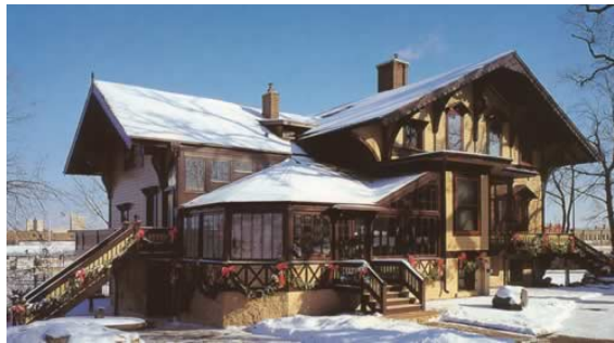
Tinker Cottage, one of Rockford's many buildings listed on the National Register of Historic Places

Here's your Rising Star, the quarterly e-newsletter that contains the latest news about development opportunities in the growing Rockford area. For more information, visit www.rockfordil.com .