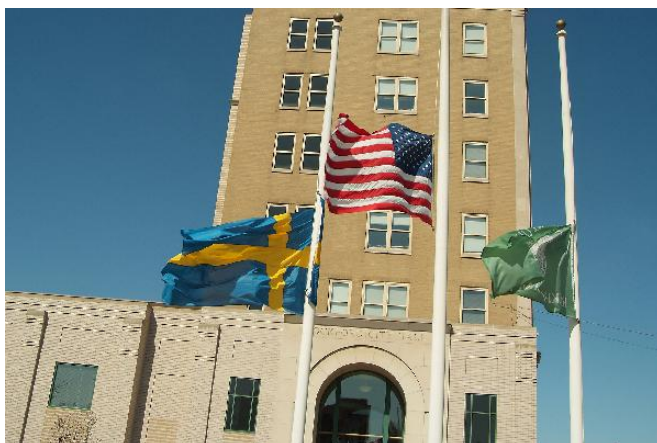
Rockford's City Hall

As part of their visit, the group will meet with educational and municipal representatives in the Rockford area, visit schools and companies as well as participate in forums to exchange ideas.