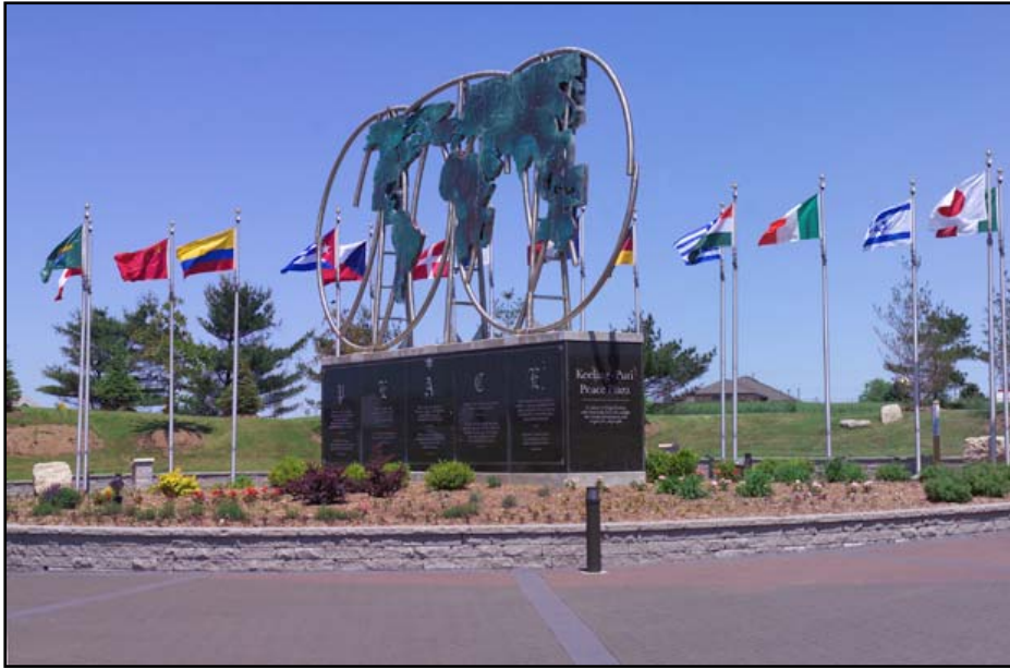
The Keeling-Puri Peace Plaza.