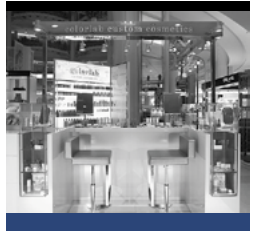
The sleek look of Colorlab Cosmetics in department stores around the world.

Colorlab products can be purchased in Rockford at Salon 1300 and Digits. www.colorlabcosmetics.com .