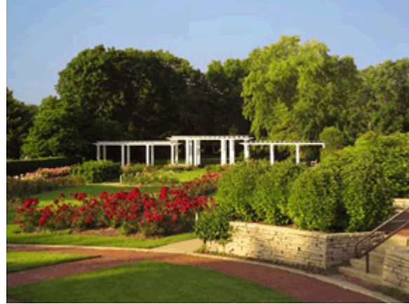
Rockford Park District, one of the leading park districts in the country, celebrates its 100th anniversary in 2009.