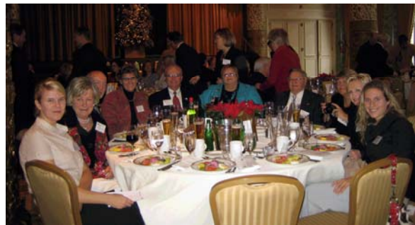
Rockford group enjoys SACC-Chicago's Lucia luncheon.

A group from the Rockford area attended the Swedish-American Chambers of Commerce-Chicago's annual Lucia luncheon on December 5 at the historic Drake Hotel. We enjoyed traditional Swedish Christmas food and drinks, as well as a lovely Lucia choir that sang Christmas songs in both Swedish and English. God Jul!