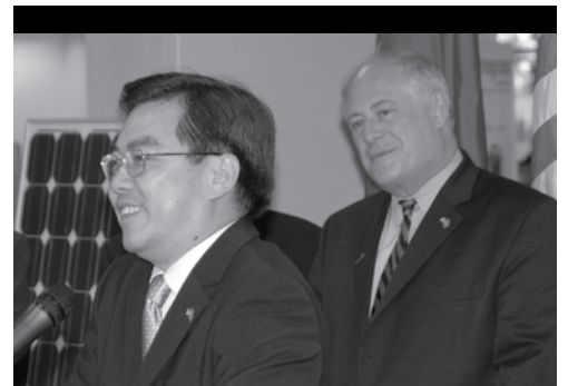
Chinese Consulate Huang Ping and Illinois Governor Pat Quinn at a recent news conference announcing the new solar-panel plant.