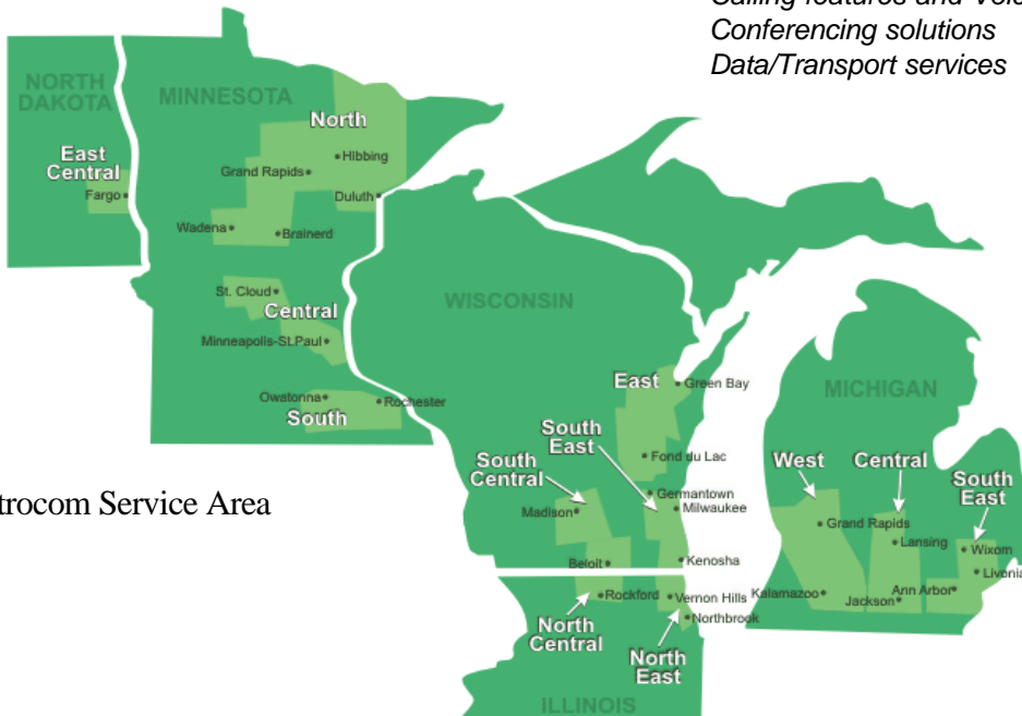
TDS Metrocom Service Area